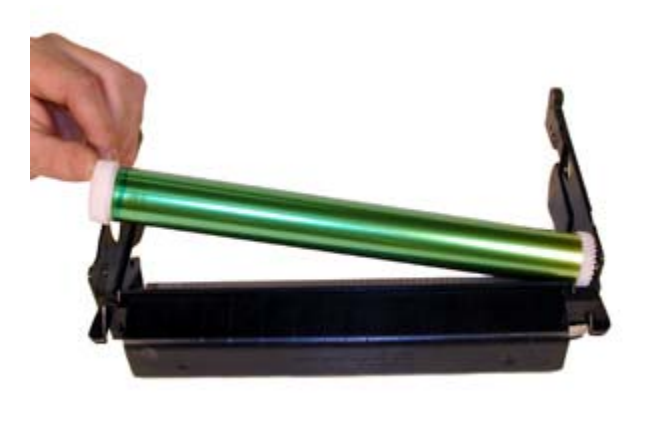
Figure 5 Figure 6

6) Carefully lift out the PCR. The PCR holders will most likely come out with the PCR. This is OK. It makes it easier to re-install it later. Be very careful not to touch the roller with your skin. As with any PCR, the oils naturally present in your skin will be absorbed by the roller and cause printing problems. (Extra marks on the page) See Figure 7