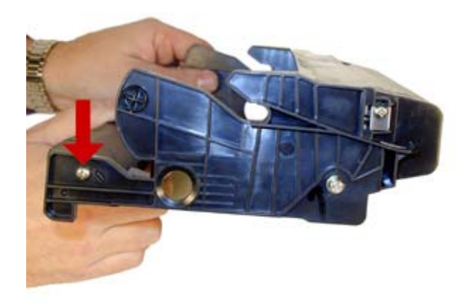
Figure 15 Figure 16

16) Just to make sure that everything is meshing properly and lubricated properly, rotate the drum by the large gear in the proper direction. This is always a good idea for drum units as a final check before installing the cartridge in your test machine.