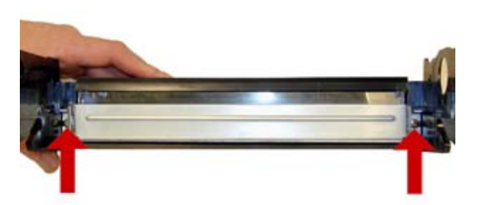
Figure 7 Figure 8