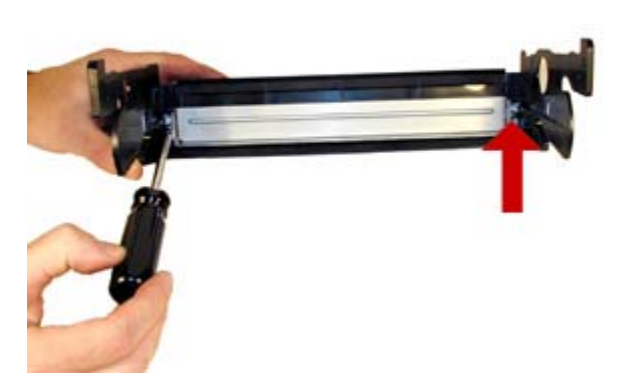
Figure 9 Figure 10

10) Clean the PCR holders with 99%pure isopropyl alcohol. Snap on to the ends of the PCR.